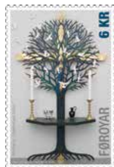
The altarpiece in Vestmanna Church was featured on a postage stamp on September 16, 2009.

This very energetic artist has made illustrations of all the birds in the Faroe Islands, fish as well as flowers and kelp. She also created the magnificent altarpiece in Vestmanna Church. Even if she had done nothing else, this would have earned her an honorary reward.