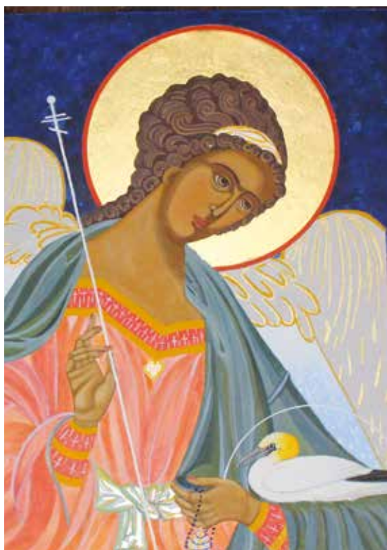
This icon was issued as a stamp on 24 September 2018

Astrid is married to Bjarki Geyti. They have two children and five grandchildren.