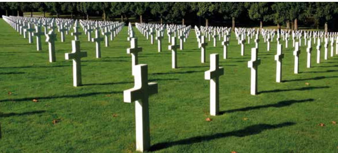
American WWI cemetery near Verdun, France